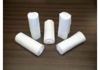
Automatic tail locator