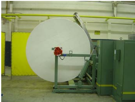
90 inch (2.3 meter) unwind capacity