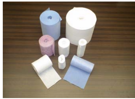
Typical Finished Product Rolls